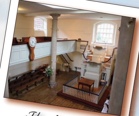
The New Room