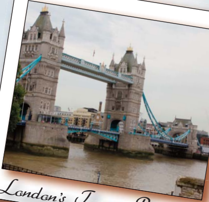
London's Tower Bridge