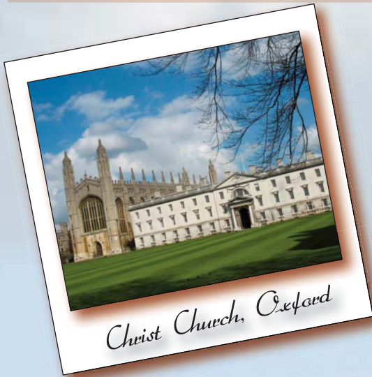
Christ Church, Oxford